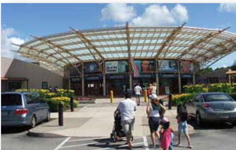
Entrance to Mystic Aquarium & Institute for Exploration