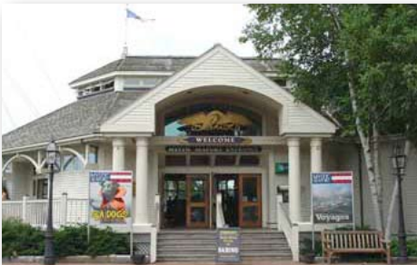
Mystic Seaport Museum

Please visit www.mysticmobility.org to share your views!