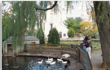
Olde Mistick Village shopping destination in "Golden Triangle" near I-95