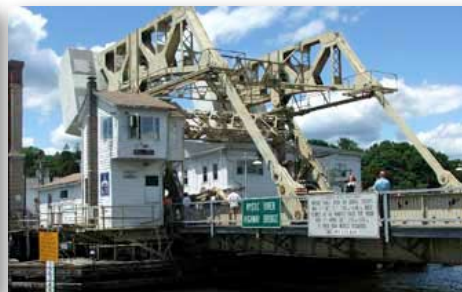
Mystic Village Drawbridge over the Mystic River joins Groton with Stonington